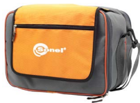
L-4 carrying case