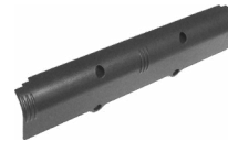
Battery pack 4xLR14