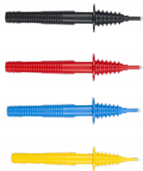
Pin probe 1 kV (banana socket) black / red / blue / yellow

WASONBUOGB1 WASONREOGB1 WASONBLOGB1 WASONYE0GB1