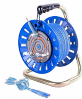
Test lead on a reel blue 75 m / 100 m / 200 m

WAPRZ075REBBSZ WAPRZ100REBBSZ WAPRZ200REBBSZ