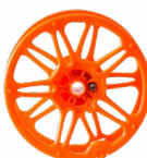
Test wire reel