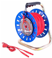
Test lead on a reel red 75 m / 100 m / 200 m

WAPRZ075REBBSZ WAPRZ100REBBSZ WAPRZ200REBBSZ