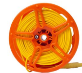
Test lead 50 m for earth resistance measurements (banana plugs) yellow