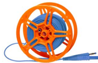
Test lead 15 / 25 m on a reel, banana plugs, blue