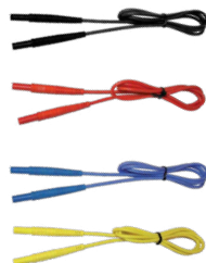
Test lead 1.2 m (banana plugs) black / red / blue / yellow

WASONBUOGB1 WASONREOGB1 WASONBLOGB1 WASONYE0GB1