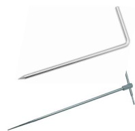
Earth contact test probe 25 cm / 80 cm