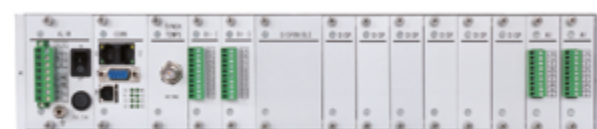
TDU 100E Front and Rear Panels

The front panel hosts the following components: