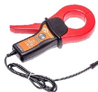
C-8 clamp WASONCEG8