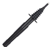
Pin probe, black 11 kV (banana socket) WASONBLOGB11