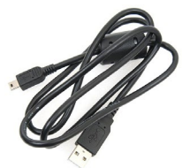
Mini-USB cable WAPRZUSBMNIB5