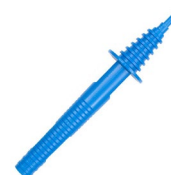
Test probe with banana socket; 1 kV; blue WASONBUOGB1