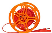
Test lead with banana plugs on reel; 1 kV; 20 m; red WAPRZ020REBBSZ