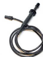
Non-contact probe WASONBDOT