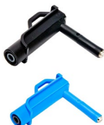
Magnetic voltage adapter black / blue WAADAUMAGKBL WAADAUMAGKBU