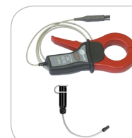
C-3 clamp WACEGC3OKR C-3 clamp adapter WAADALKOC8