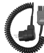
WS-05 adapter with UNI-SCHUKO angular plug WAADAWS05