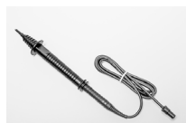
Contact probe WASONDOT