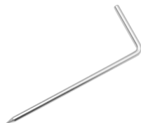
Earth contact test probe (rod) 25 cm WASONG25