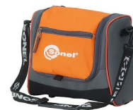
M-6 carrying case WAFUTM6