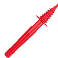
Test probe with banana socket; 1 kV; red WASONREOGB1