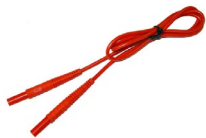
Test lead with banana plugs; 1 kV; 1.2 m; red WAPRZ1X2REBB