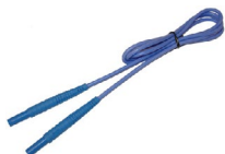
Test lead with banana plugs; 1 kV; 1.2 m; blue WAPRZ1X2BUBB