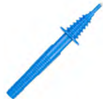
pin probe, blue 1 kV (banana socket) WASONBUOGB1