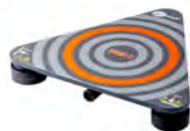
PRS-1 resistance test probe WASONPRS1GB