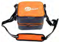
M-8 carrying case WAFUTM8