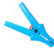
blue "crocodile" clip 11 kV 32 A WAKROBU32K09