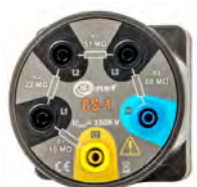
CS-1 cable simulator WAADACS1