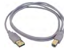
USB cable WAPRZUSB