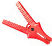
red "crocodile" clip 11 kV 32 A WAKRORE32K09