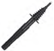
test probe with banana socket; 5 kV; black WASONBLOGB2