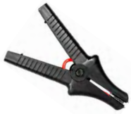
black "crocodile" clip 11 kV 32 A WAKROBL32K09