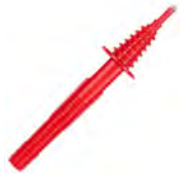
test probe with banana socket; 5 kV; red WASONREOGB2