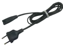
230 V power cord (IEC C7 plug) WAPRZLAD230